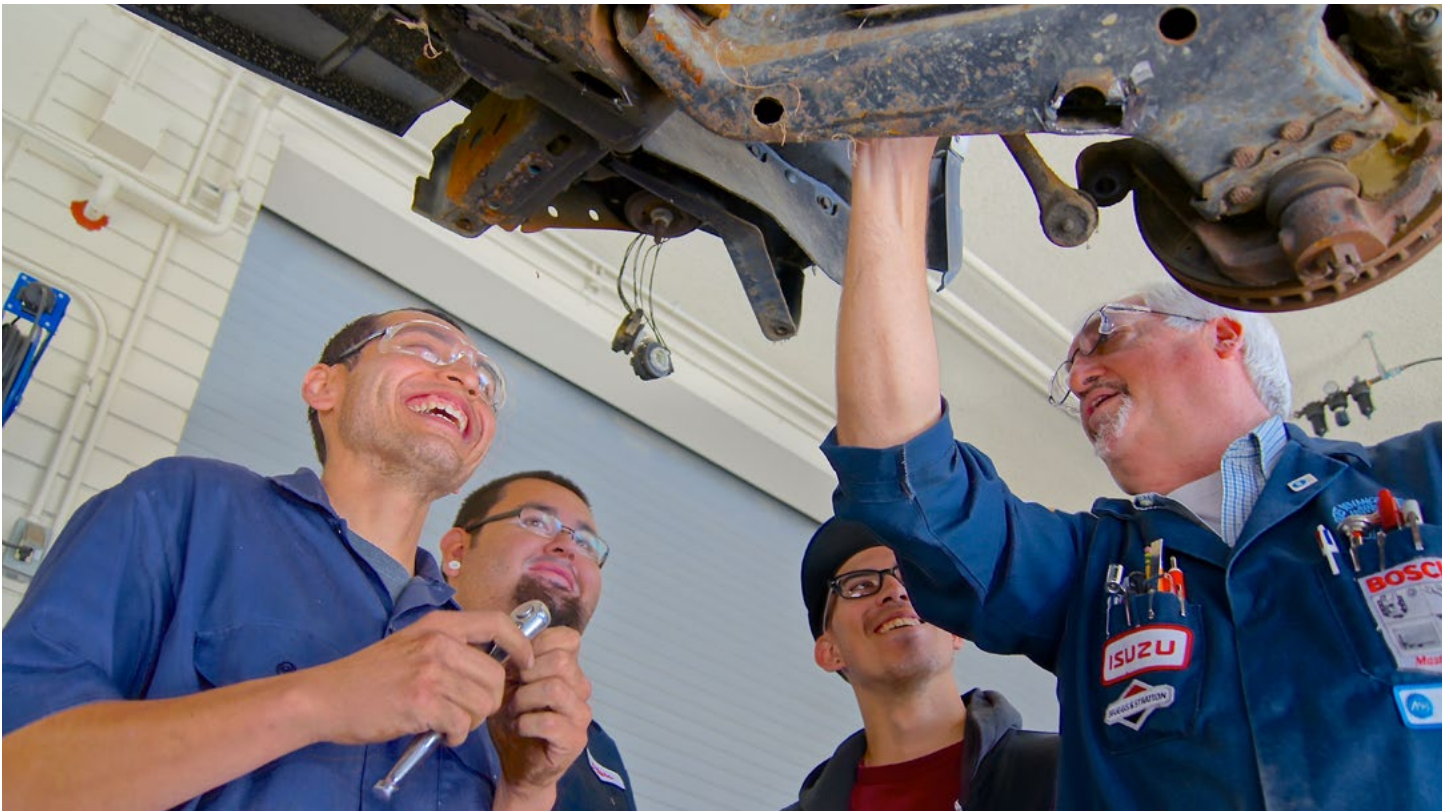
Rio Hondo Automotive Technology students with their instructor.