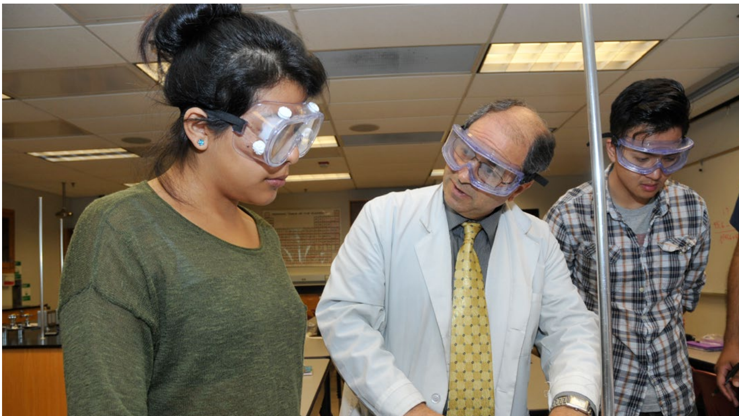
Two Mt. San Antonio College students with their instructor.